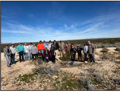
February 22, 2026 Field Trip to the Claim

The field trip to the claim on February 22, 2026 started out cold but soon turned out to be a warm and beautiful day. Eleven hounders from the AV Club joined with eleven members from SPRC for a total of 22 club members in attendance. Thanks to everyone who came and contributed to a wonderful day.