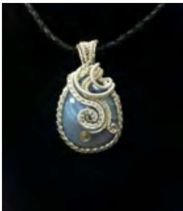
Wrap by Greg Langewisch